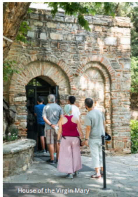
House of the Virgin Mary