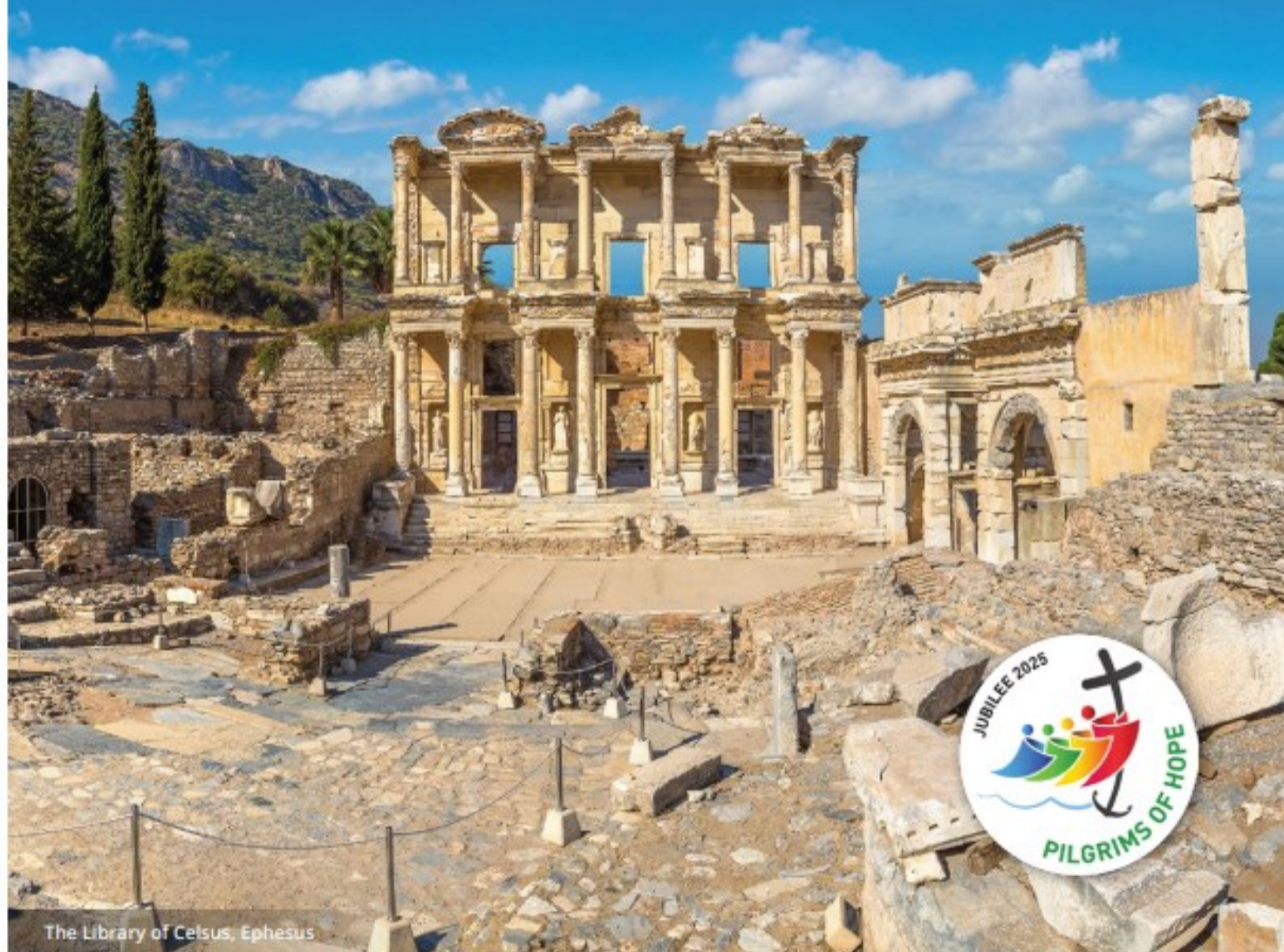
The Library of Celsus, Ephesus